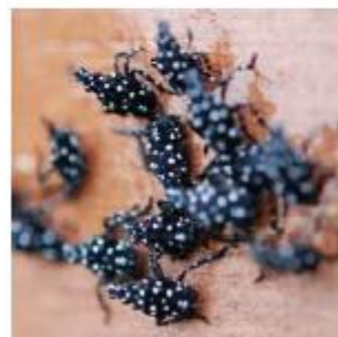
Second Instar: June - July