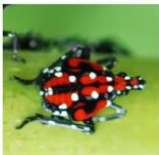
Fourth Instar: July - September