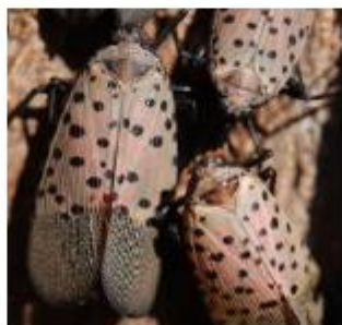
Adults: July - December