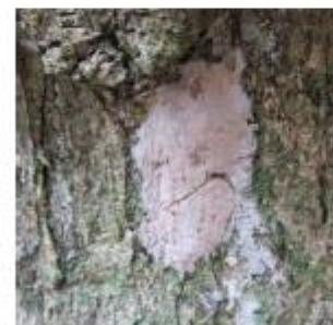
Eggs: October - June