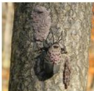
Egg Laying: September - November