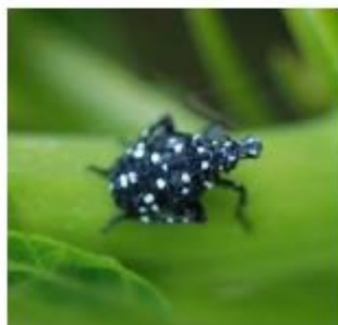
Third Instar: June - July