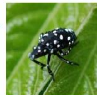
Hatch and 1st Instar: May - June