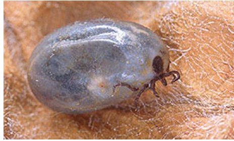
Adult female blacklegged tick, Ixodes scapularis Say, engorged after a blood meal.