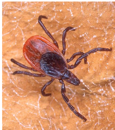
Female blacklegged tick, Ixodes scapularis Say.

http://entnemdept.ufl.edu/creatures/urban/medical/deer_tick.htm