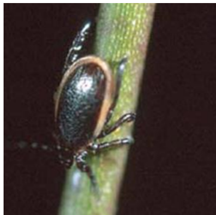
Male blacklegged tick, Ixodes scapularis Say.