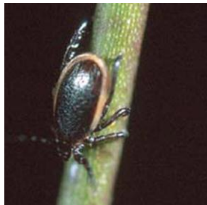
Male blacklegged tick, Ixodes scapularis Say.